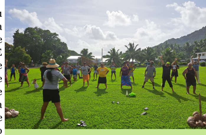
Warm-up, akauka style. Arataki ia e Ati Tereu.

Kua akatu'anga ia e toru pupu; Ko te Tapere Avatiu e Ruatonga, Tutakimoa e Takuvaine, e pera Tupapa e Maraerenga. Kua akamata to matou ra na roto i te akaeta uaua (warm up) tei arataki ia e Ati Tereu. E kua akamata matou i te porokoramu mua koia ko te patupatu poro (volley ball), aru mai i te reira ko te ko akari, te rangaranga pare ukarau, apuka e te tapakau e pera te peipei tiporo. Kua rave katoa matou i te tu'anga o te oro tukutuku rakau(relay) e te putoto taura (tug of war), tei akatakake ia na roto i te Apii Sabati te Mapu e te Ekalesia.