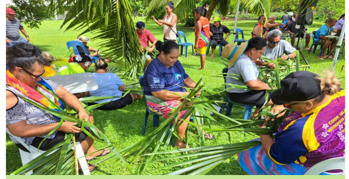
Tupapa, Maraerenga, e rangaranga nei i ta ratou, pare ukarau, apuka e te tapakau. Ekalesia.