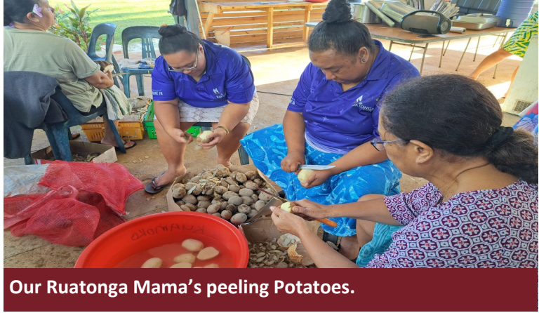
On Friday the 14<sup>th</sup>, was also a free day as well, however, our Ruatonga group was asked to host the Ivirua community dinner for that Friday, as the Ivirua community were part of the production show that was displayed later in the evening of that day. So, we happily took on the challenge of being chefs despite half of the team following bus tour of the island, which surprisingly went well and

Lighting of 200 candles on a cupcake, marking 200 years of the Gospel to Mangaia.