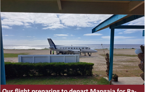
Our flight preparing to depart Mangaia for Rarotonga.

the trials and tribulation that shaped the Christian faith as we see it today. And how the people of Mangaia and the Cook Islands can carry on the Christian faith for the future ahead of us. This closing wraps up the entire celebration week.