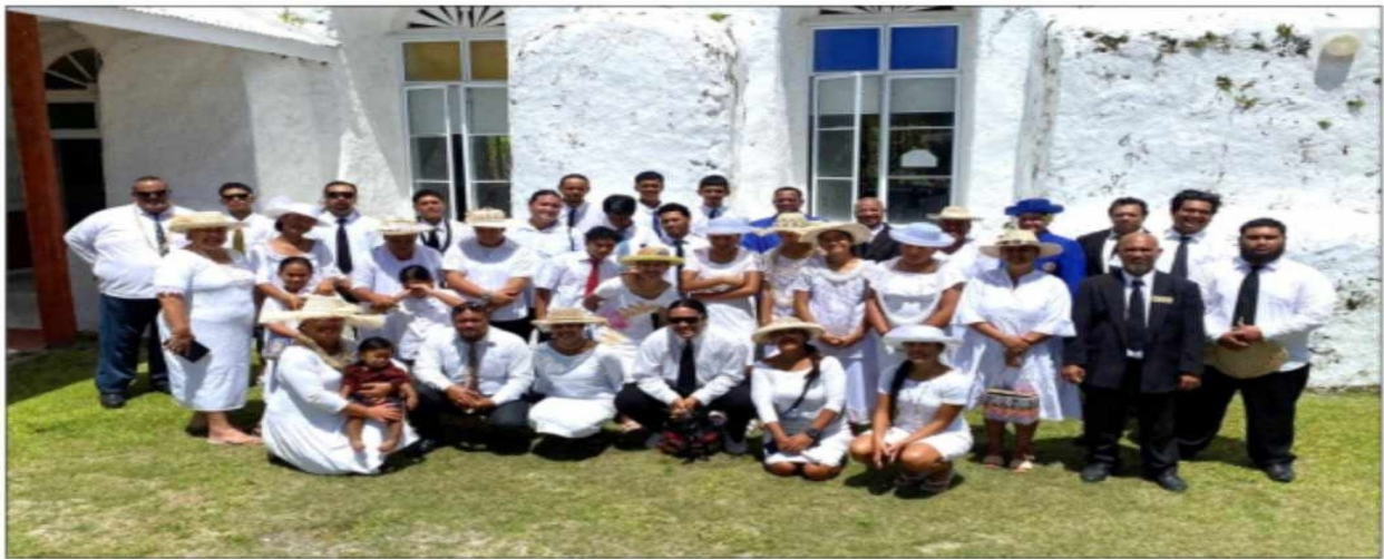
Tapere Rutaki Mapu tei tere ki Matavera

I would like to share my own reading to our viewers.