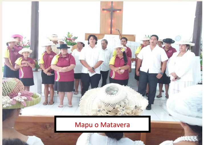
Mapu o Matavera