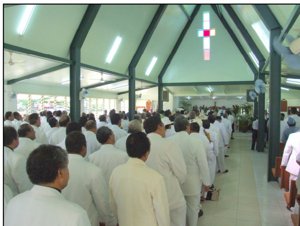
Assembly at Nikao, April 2009