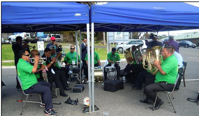
Images from past CICC assemblies

Komakoma mai ki te Tekeretere Maata me e au uianga tetai i mua ake ka aere mai ei ki te uipaanga, tena tona au numero i runga i te kapi mua o teia pepa. I te tuatau o te uipaanga maata, te vai ra te aronga angaanga te ka riro i te tauturu i tetai uatu me anoanoia. Ka riro katoa te au mema o te au oire ka noo kotou i te tauturu i tetai uatu me anoanoia. Ko tetai uatu au akakitekiteanga ka anoanoia, ka oronga iatu i te tuatau o te uipaanga.